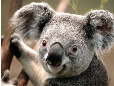
Figure A.1. This little fellow likes to eat eucalyptus leaves. Thus, he and his fellow species members are found in eucalyptus forests.