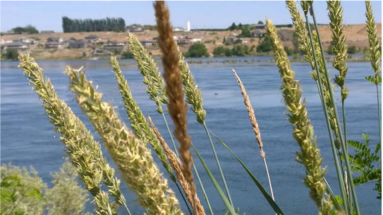
Figure 2. Caption-Fig